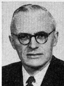
BERKOUWER "new attention"