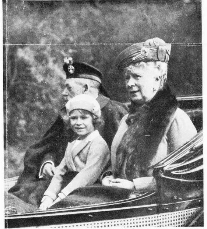
During the annual visit of Their Majesties the King and Queen to Balmoral, Princess Elizabeth accompanied her grandparents to Crathie Church for the first time. The little Princess paid close attention to the service.