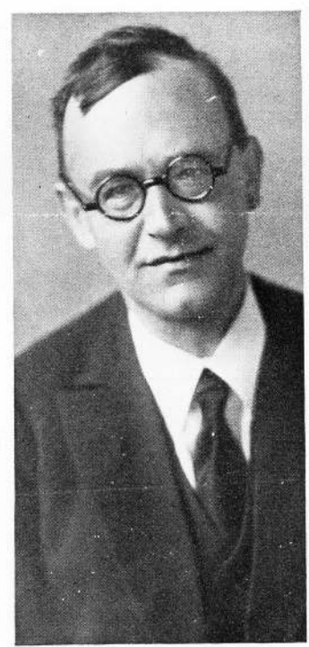
Professor Barth, the world-famed theologian, whose teaching is the centre of discussion. A new portrait which will be appreciated by those who are interested in his books.