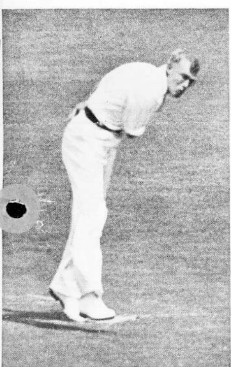
No cricketer in England was more discussed this year than W. E. Bowes, the young Yorkshire bowler. His selection, at the last moment, to join the Test Team adds to the interest of the coming matches in Australia. He is a Methodist, as are two other members of the M.C.C. team. Yorkshire's captain, Mr. A. B. Sellers, was married recently in a Methodist church.