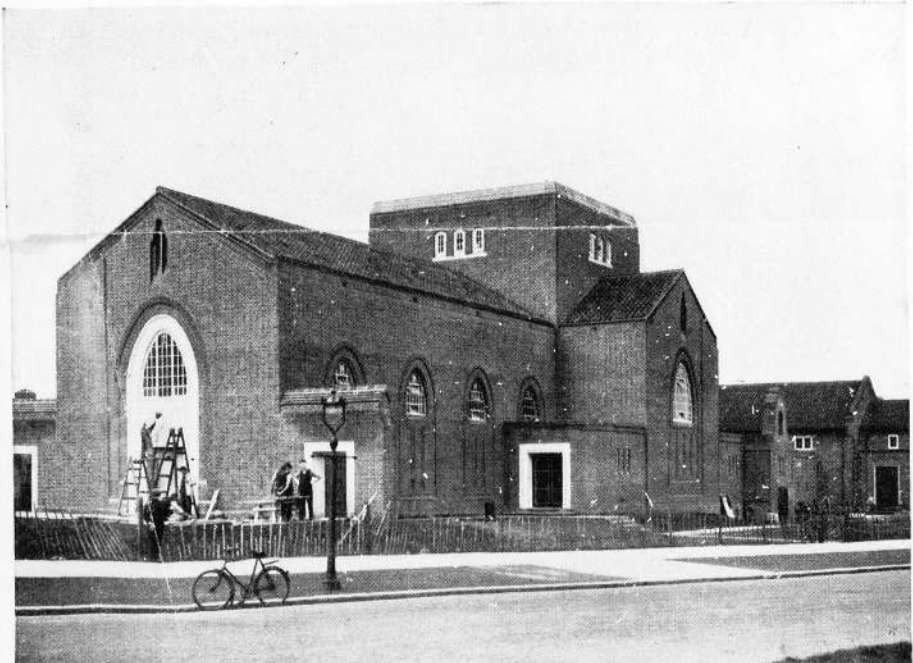
The Children's Church of St. Christopher, lately consecrated by the Bishop of Liverpool. The money for its erection was subscribed by children who formed an Order of Jubilee Campaigners. The church has been described as the "Toy Cathedral of Liverpool."